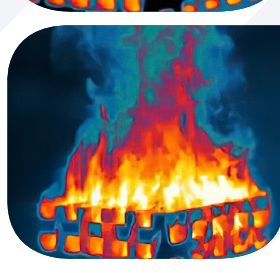
Multispectral image of burning wood crib