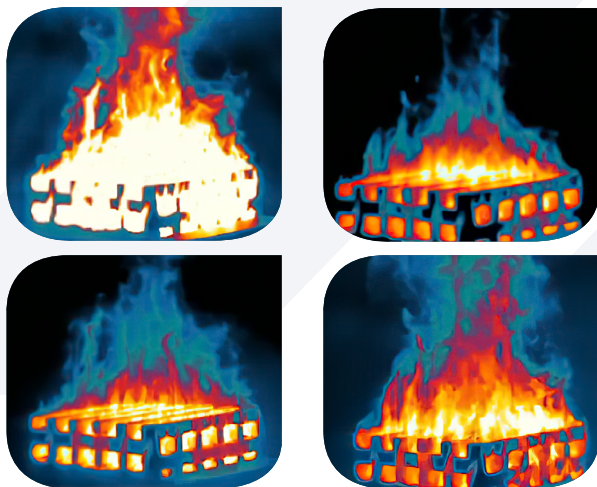
Multispectral image of burning wood crib